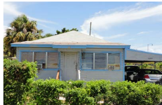
609 52nd Street - Included in Offering